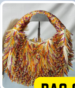
BAG & ACCESSORIES